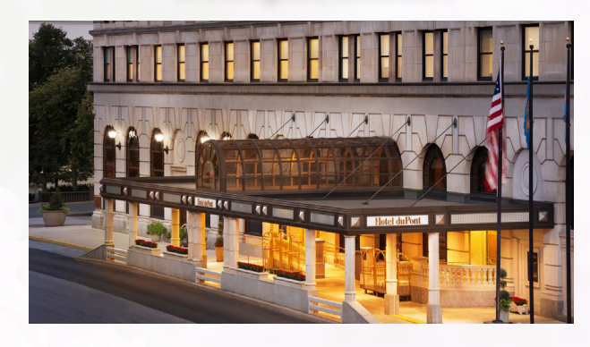
Historic Hotel Du Pont is our Host Hotel for The Fall Event